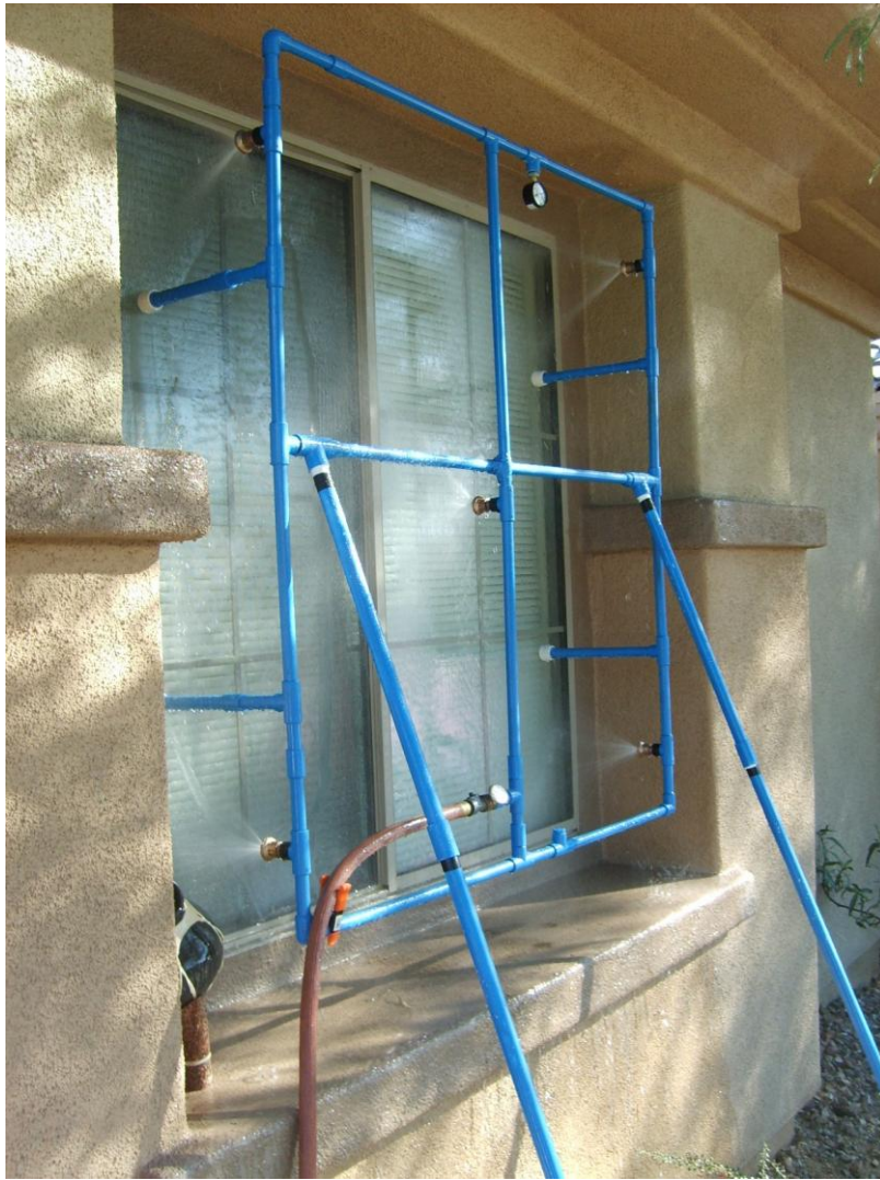
Figure 10: Calibrated spray rack set-up