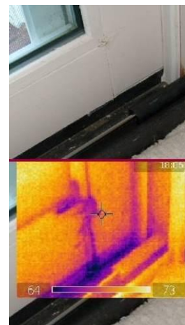
Figure 3b: Water intrusion at a door