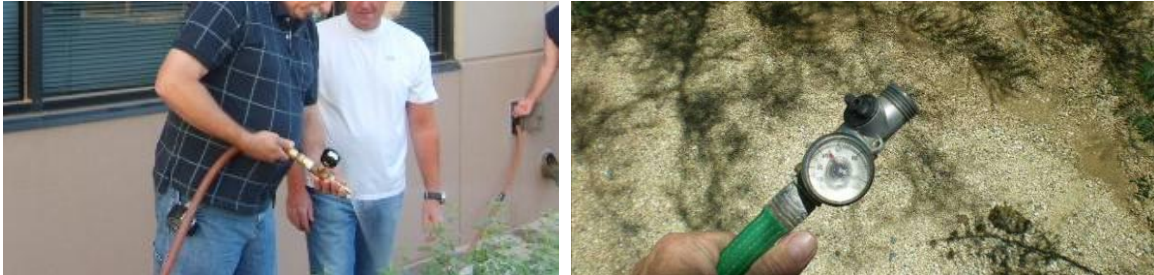
Figure 8a/8b: Calibrated hose test in the simplest form

deliver water to the test specimen at prescribed pressures. The test procedure consists of systematically wetting the test specimen with water from a spray nozzle that is held at a distance of at least 12 inches from the joint. The nozzle is moved slowly back and forth along the non-operable joint, covering approximately 5 linear feet of joint during a 5-minute period. This test is not intended for residential use.