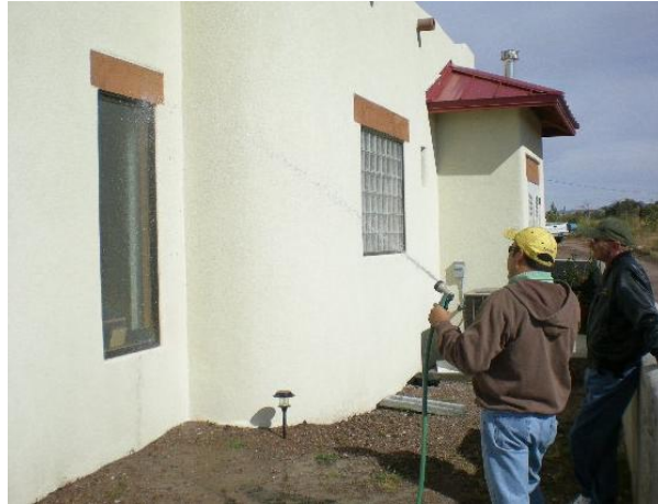
Figure 7: Non-calibrated hose test being performed