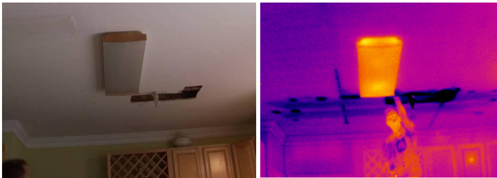
Figure 4: Plumbing fixture leak in a house, found in seconds with an infrared imager.

When plumbing pipes, (see figure 4), water lines, sprinkler lines, or mechanical lines within the structure leak, the damage can be devastating. Often, by the time the water leak is detected, much damage has already occurred. A broken plumbing pipe that goes unchecked for minutes, hours or in some cases, days, can cause horrific damage not only to the interior, but also to the structure of the building itself. Some problems caused by condensation on mechanical lines in an attic or within walls, such as low pressure return lines or a condensation evacuation line for an air conditioning unit can be quite insidious. These failures can contribute to a hidden growth of large colonies of mold. Infrared thermography is particularly good at tracking down active leaks of almost any kind.