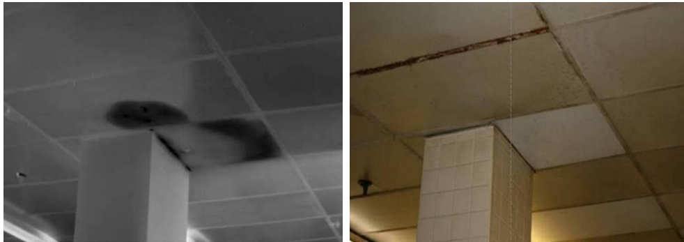
Figure 5: Uninsulated column passing from cool area into the warm, moist interstitial space, causing condensation on the column, which then drips onto the ceiling tiles.