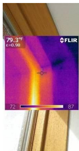
Figure 3a: Water intrusion at a window

The very best time to perform an infrared thermographic inspection is when the leak first presents. An infrared image documents the reality of the situation (see figures 3a/3b) and is the basis from where the investigation should go from there. With the proper information from the infrared inspection in hand, a builder may elect to remove interior finishes from around the window or door if a thermograph shows water not under a window - but off to the side of it. The same holds true for a door unit. An infrared thermograph offers a way to document water intrusion and may indicate that the leakage is under the doorsill for instance, which the builder must then correct himself.