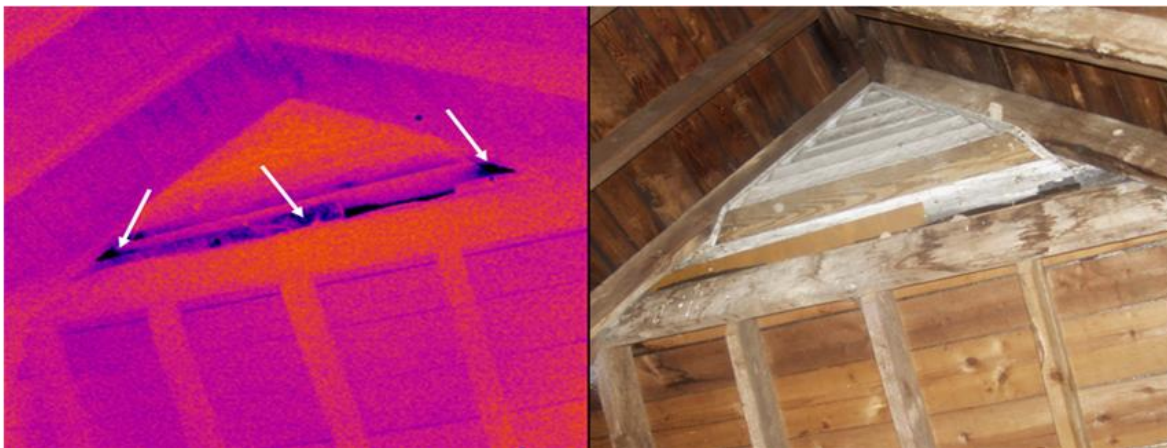
Figure 1: Water entering the attic of a large church at the gable end vent

Water can leak into a building from the roof or skylights in the roof. A roof leak over an accessible attic space makes for some very easy detective work during a regular rain event. A flashlight is normally all that one needs to ascertain where the leak started and where it's going. If the manufactured skylight component itself can be eliminated as a source of water intrusion, then the likely cause would be inadequate or improper flashing of the unit to the roof. Water leaking at the roof-to-chimney juncture or any other place such as venting, is usually easily found visually and even more easily found with an IR imager (see figure 1). A combination roof/ceiling assembly created using scissors trusses proves to be one of the most difficult investigations to accomplish due to lack of access.