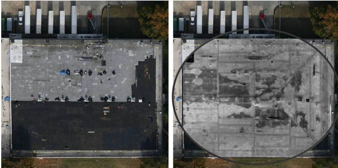
Figure 6: Flat roof with wet insulation (lighter gray) being covered with new coatings

No other documentation of moisture is better than IR. To prove this fact...as a result of how well infrared thermography documents water intrusion, at least one of the largest OS window and door manufacturers has recently issued a written order that no employee, service provider, or dealer may bring an infrared thermal imager anywhere near any of their products, for any reason. As a guide to documenting water intrusion in buildings, below you will find some pertinent standards, in several categories and how infrared thermography can enhance the tests.