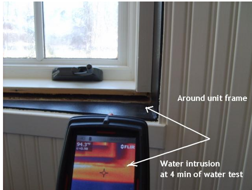
Figure 9: Infrared imager documents water intrusion