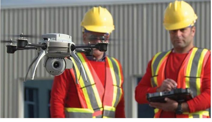
FAA regulations require that a person operating a small UAS either hold a remote- pilot- airman certificate with a small- UAS rating or be supervised by a properly rated person.

A person operating a small UAS must either hold a remote-pilot airman certificate with a small UAS rating or be