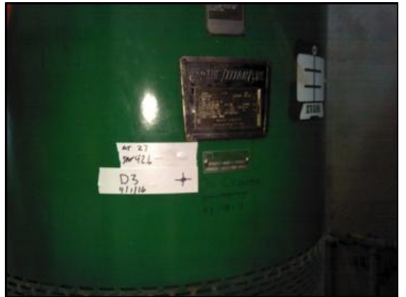
Figure 2 – Motor D3 noting identified hot spot with "†"

To illustrate use of the above table, on September 1, 2016, the authors performed a thermal condition assessment of two 300HP vertical motors pumping raw water to several cities in southwest Oklahoma. Thermal and corresponding color images of both motors D3 and L2 are shown below. Note that brighter colors (orange) indicate heat and darker colors (pink) indicate cool. Hot spots on motor cases always tend toward orange/yellow.